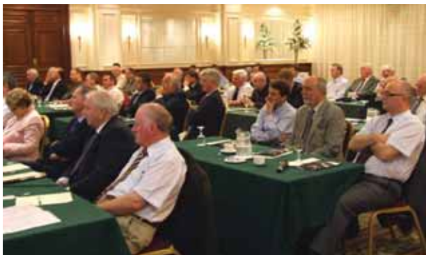
Attendance at an ICF Seminar.

With this in mind, the Federation developed a new database of approximately 300 contacts within our industry, all of which now receive regular ICF updates. These updates outline the key working agendas of our committees and are clear and visible proof of the broad agenda which the Federation undertakes on behalf of its members.