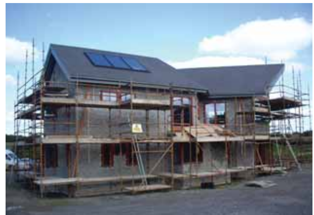
Zero Carbon Emissions House – Ready for Insulation and Render.

The Irish Concrete Federation continues to support the development of Ireland's first ever zero carbon emissions concrete house in Mount Temple, near Moate, Co Westmeath. This exemplar project, which is scheduled for completion in 2010, will clearly show the ability of concrete materials to contribute to the highest forms of sustainability and energy efficiency. The move towards greater energy efficiency in our homes is irreversible and therefore, with this in mind, the Federation made a commitment to the Minister for the Environment, Heritage and Local Government that it would support the development of this unique exemplar project to illustrate the ability of our members' materials to meet these new standards.