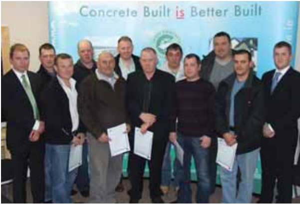
Roadstone Wood employees pictured at presentation of QSCS Certificates.