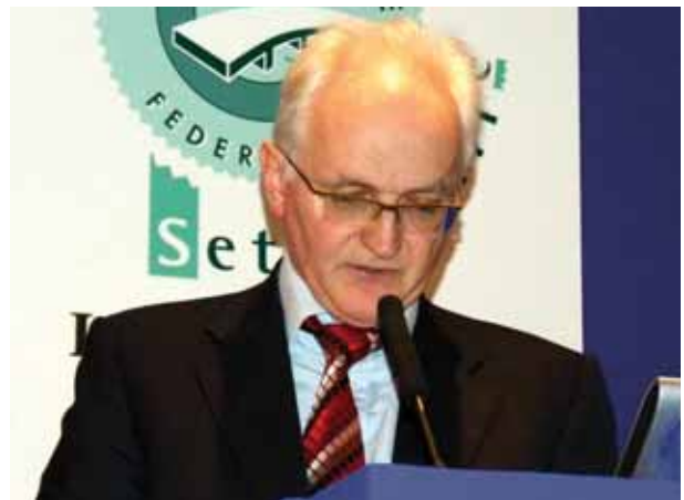
Minister for the Environment, Heritage & Local Government Mr John Gormley TD addressing ICF and IMQS Environmental Seminar in November.

ICF continues to promote best practice in relation to planning and the environment with its members. However there is need for a similar commitment by the local authorities in relation to the issue of unauthorised development. While our industry contracts, it is imperative that local authorities and Government are seen to source materials from those operators who show commitment to compliance with their planning status and operate to the highest standards of environmental practice. In this respect, ICF welcomes the inclusion of the introduction of a licensing system for quarries in the revised Programme for Government.