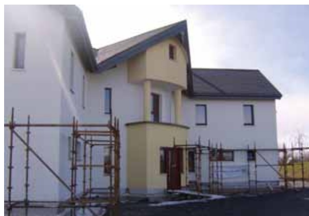
The front of the Zero Carbon Emissions House.

The Federation continued to write articles promoting our members' products and sustainability to trade media throughout 2009. In particular there have been regular features and articles, featuring our industry and its products in construction in trade journals and we look forward to continuing this activity in 2010.