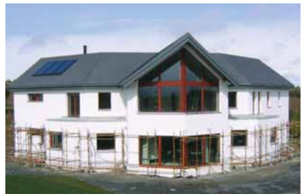
The back of the Zero Carbon Emissions House.

The Irish Concrete Federation continues to support the development of Ireland's first ever zero carbon emissions concrete house in Mount Temple, near Moate, Co Westmeath. This exemplar project, which is scheduled for completion in 2010, will clearly show the ability of concrete materials to contribute to the highest forms of sustainability and energy efficiency. The move towards greater energy efficiency in our homes is irreversible and therefore, with this in mind, the Federation made a commitment to the Minister for the Environment, Heritage and Local Government that it would support the development of this unique exemplar project to illustrate the ability of our members' materials to meet these new standards.